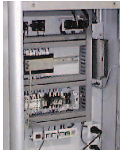
Internal control panel

For more information, please contact your local FlexLink sales unit. Specifications are subject to change without notice.