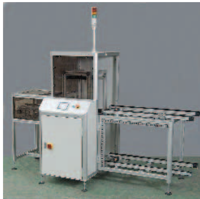
Powered two tier platform

For more information, please contact your local FlexLink sales unit. Specifications are subject to change without notice.